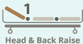
Head & Back Raise