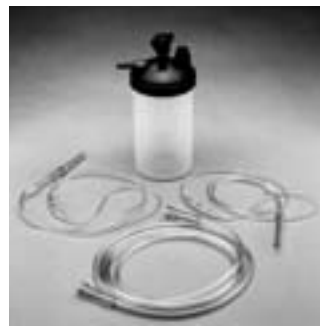
Start-up Kit Available with P/N 7100 or P/N 7600 Humidifier