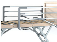
Foldable Side Rail